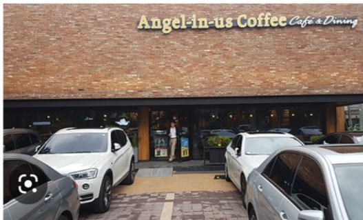
Angel In Us...