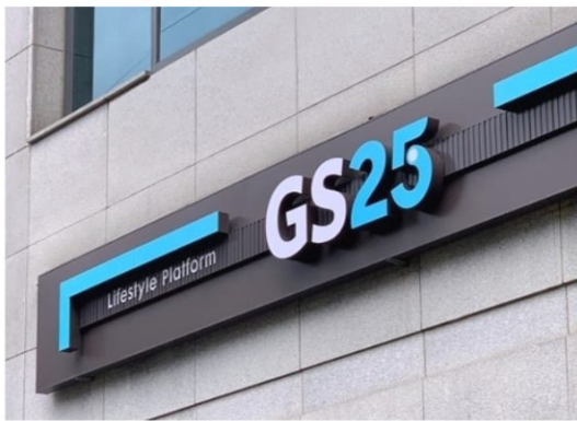
GS 25 Convenient Store ...