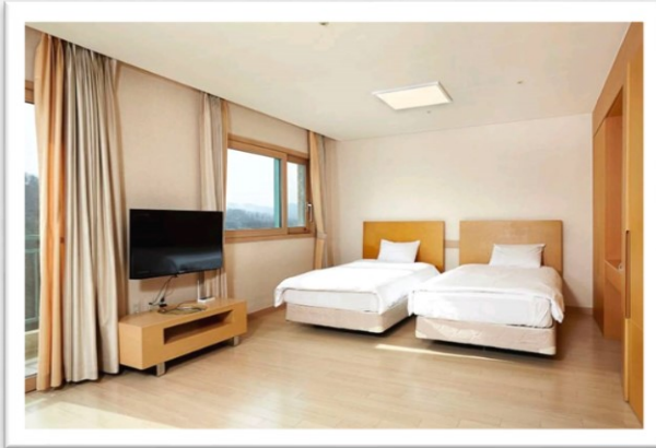
Twin Bed Room...

They have various types of rooms available and shall be able to accommodate everyone in the same hotel.