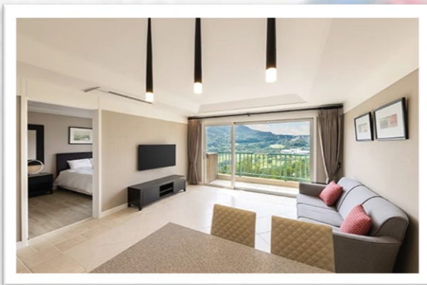
Family Room For 3 To 4 People...