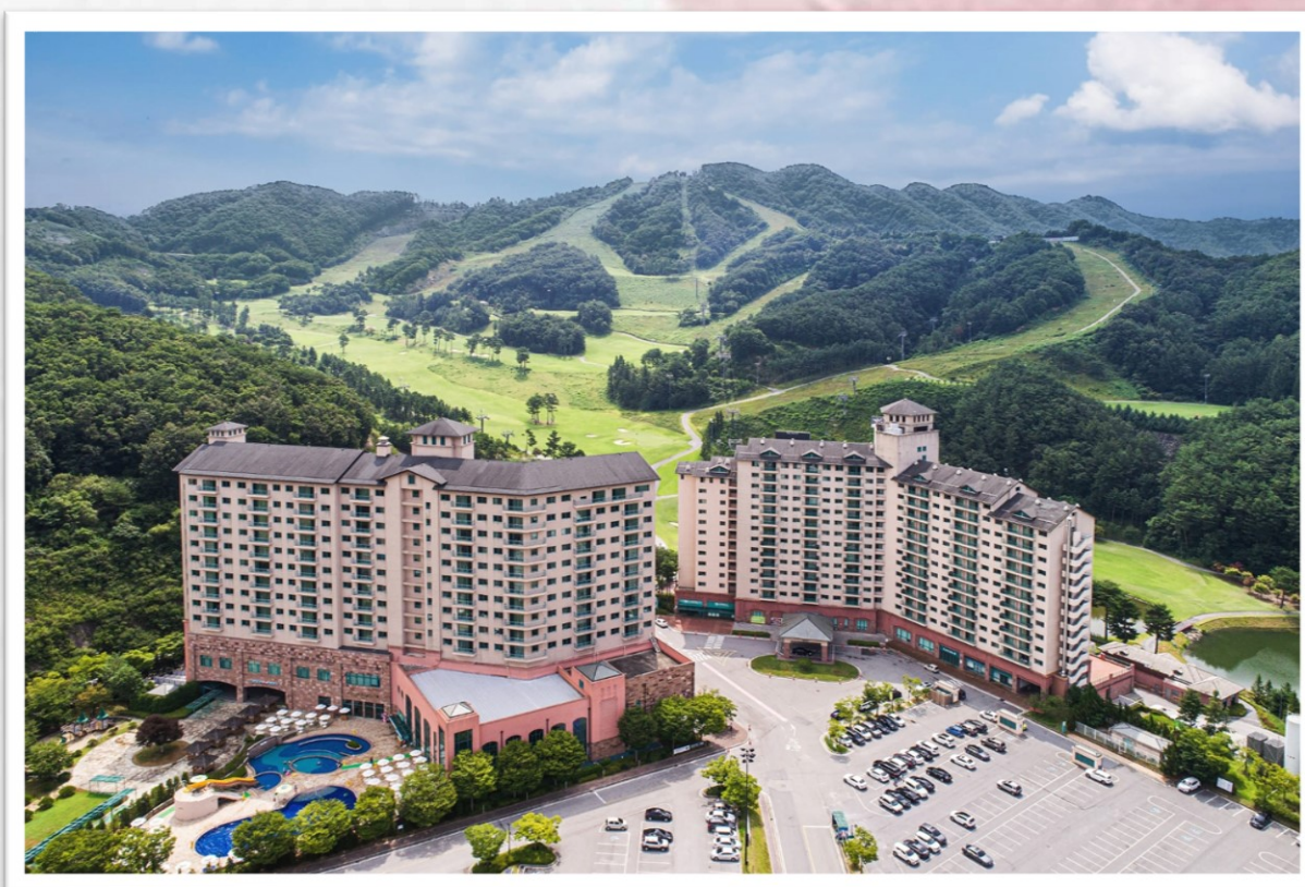
Oak Valley Resort Hotel, Wonju City, Gangwon Province ...