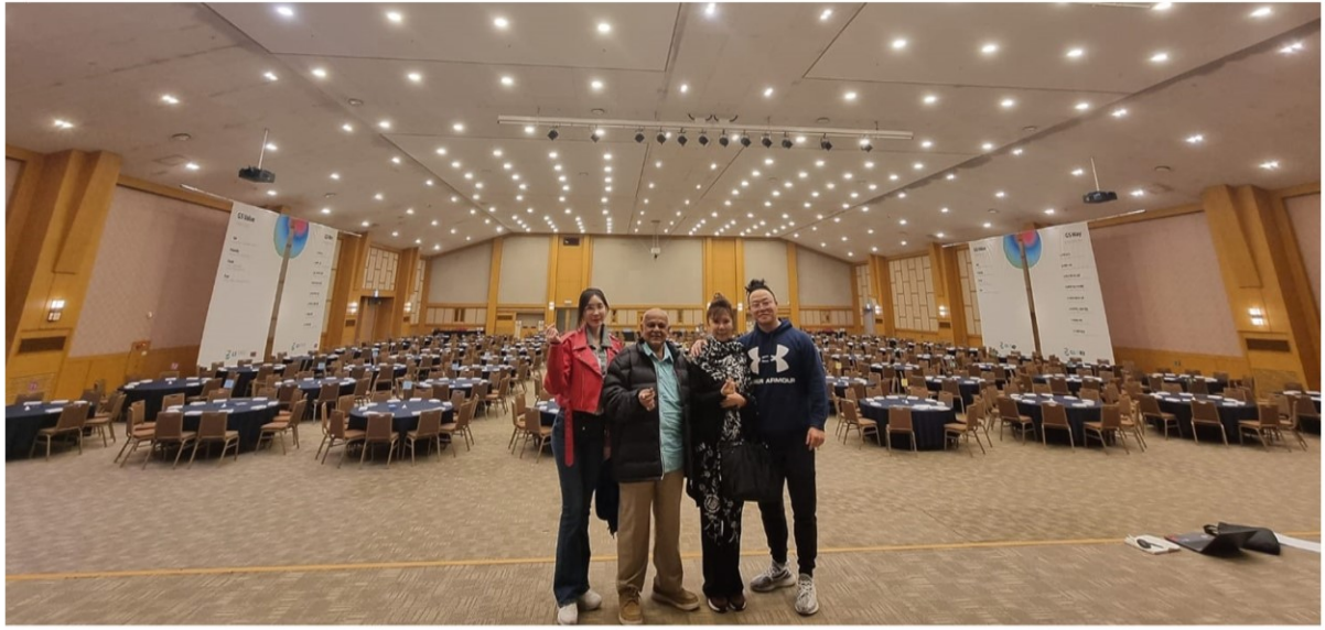
Large And Spacious Dining Hall For Breakfast, Lunch, And Dinner ...